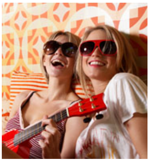
Surrounding yourself with happy people is healthy!

What's one way to get happy? Try massage! Exposure to stress, a contributing factor to unhappiness, over a long period of time can increase the rate of neural degeneration and increase the risk for Alzheimer's disease. Luckily, a study from Umea University in Sweden has shown that just five minutes of massage has the potential to lower stress, and 80 minutes of massage has a tremendously positive effect on stress levels. Get massage, get happy, and cheer up your friends and family!